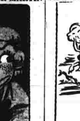
I DON'T WANT TO BE A MOTHER!