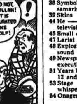
AND THEN SHE SAYS 'I'M SORRY'!