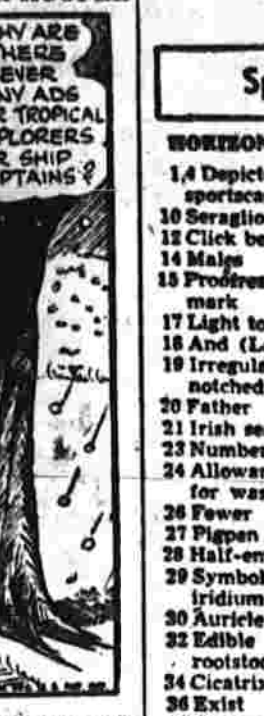
BORN THIRTY YEARS TOO SOON