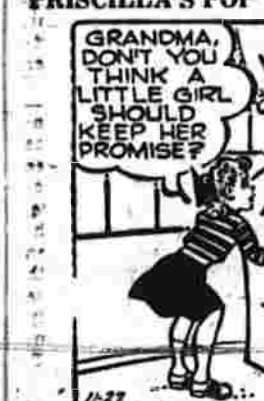
I DON'T WANT TO BE A MOTHER!