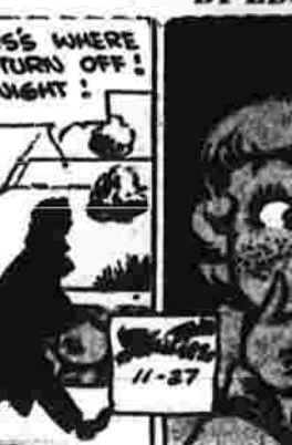
I DON'T WANT TO BE A MOTHER!