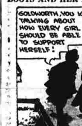
I DON'T WANT TO BE A MOTHER!