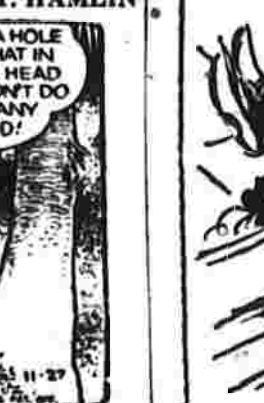
I DON'T WANT TO BE A MOTHER!