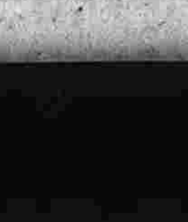
I DON'T WANT TO BE A MOTHER!