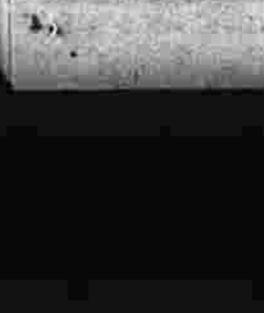
I DON'T WANT TO BE A MOTHER!