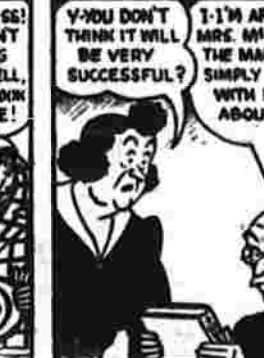
AND THEN SHE SAYS 'I'M SORRY'!