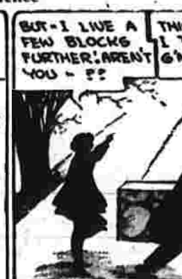
I DON'T WANT TO BE A MOTHER!