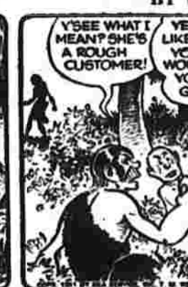
I DON'T WANT TO BE A MOTHER!