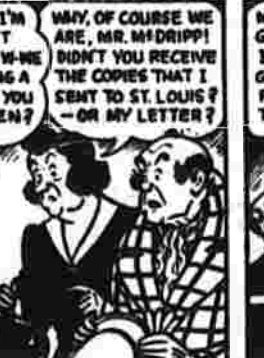
AND THEN SHE SAYS 'I'M SORRY'!