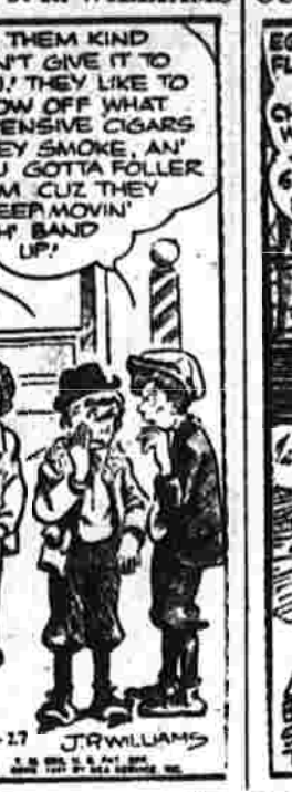
BORN THIRTY YEARS TOO SOON