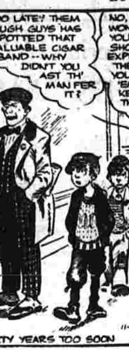
BORN THIRTY YEARS TOO SOON