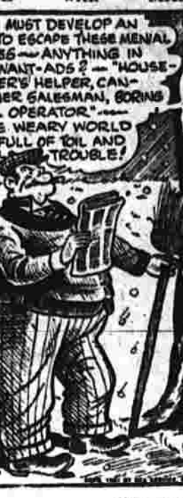
BORN THIRTY YEARS TOO SOON