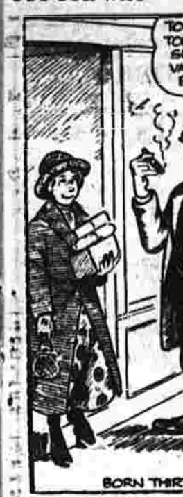
BORN THIRTY YEARS TOO SOON