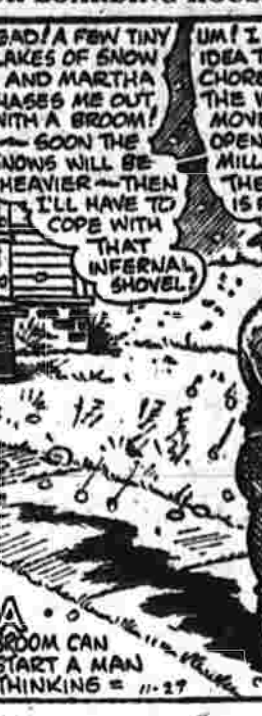
BORN THIRTY YEARS TOO SOON